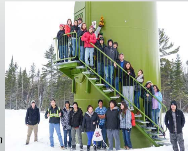
M'Chigeeng First Nation Wind Farm